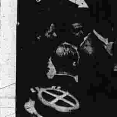
Howard Hughes (above) is shown in front of one of the motors of his sleek monoplane at Le Bourget field, Paris.